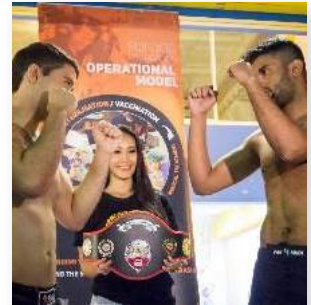
Boxing Championship - Thailand