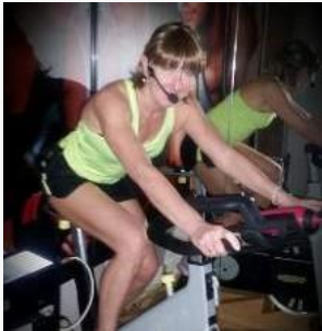
Halloween Spinathon - United Kingdom

BELOW ARE SOME EXAMPLES OF EVENTS AND ACTIVITIES ORGANISED OR JOINED BY SOI DOG SUPPORTERS, TO HELP THE DOGS AND CATS OF THAILAND.