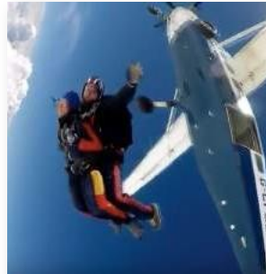
Parachute for 80th Birthday - United Kingdom