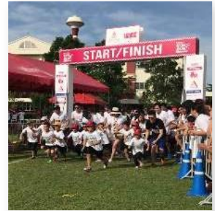
Charity Fun Run - Thailand