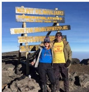
Climbing Kilimanjaro - Tanzania