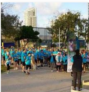
Annual Scrub Run - Australia