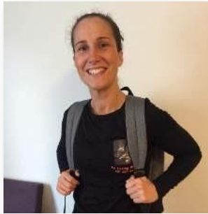
Mountain Trekking - United Kingdom