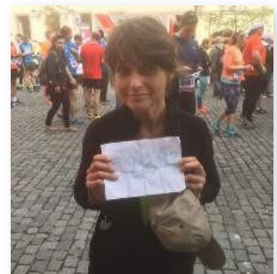
Prague Marathon - Czech Republic