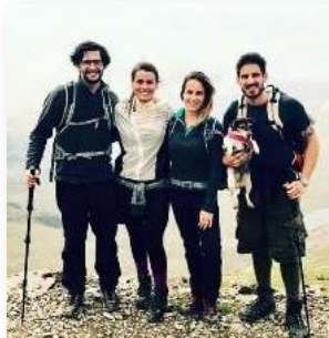
Everest Challenge - Nepal