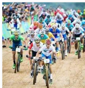
Cross Country Cycling - United Kingdom