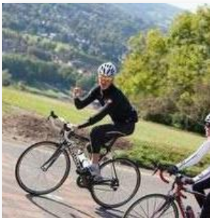
60 Mile Cycle - United Kingdom