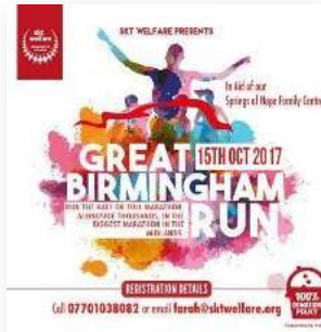
Birmingham Marathon - United Kingdom